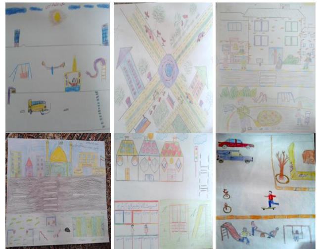
Figure 2. Favorable neighborhood characteristics from the children's point of view

The findings of the study showed these items in the painting of the children: 1- bikeways, 2- green spaces and planted places with sitting spaces on the sidewalk, 3- fountain at the center of the neighborhood, 4- walking ways for daily shopping, 5- cleanness of the neighborhood, 6- crossing to cross secured, 7- specific furniture for parents at the playground, 8- edges of the building and their facades, 9- separated mounted and pedestrian way, 10- favorite shops such as : ice cream, confectionary, fruits shop, restaurant, fast food, department store, flowers shop, 11- road signs and colorful pavements and facades, regular skyline and center of the neighborhood.