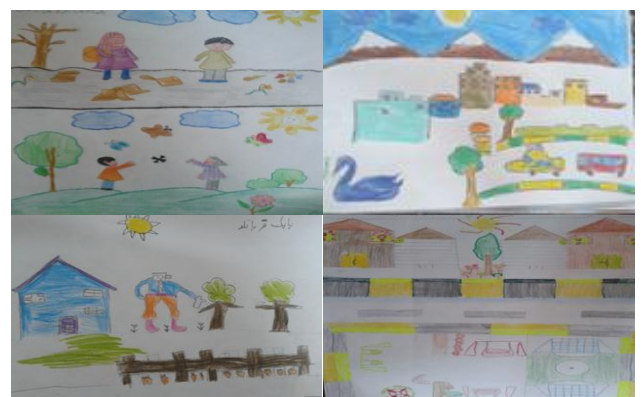
Figure 3. Neighborhood design for children

The other finding from the painting analysis show that, 1- Shared playgrounds of the children (boys and girls) existence at early ages with tidy places. 2- Hills existence for children to play on. 3-green spaces between the buildings along the path. 4- Soccer field, badminton court and swings by the residential buildings. 5- Green spaces in front of the houses which are managed by the children. 6- Place for in-line skating. 7- TV existence at the park to watch kids program on together. 8- Trees at the sidewalk and benches along them. 9- Separate mounted and pedestrian way, school and mosque at the neighbourhood and suitable ways for going to school with public transportation system like taxi and bus, statues of animals and safe playground between houses.