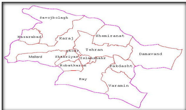
Figure 1. The limit of the Tehran metropolitan area and counties