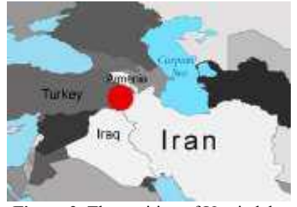
Figure 2. The position of Urmia lake

Normal and deviated dams have been built on 14 out of 15 permanent rivers providing water of Urmia Lake. According to the report issued by the water resources investigation office, water resource of three rivers including Siminehroud, Ajichay, and Zarinehroud provide 60 percent of the total flow entered the Urmia Lake. In other words, the Lake is deprived of around 60 percent of its share because the entering flows of the three noted rivers have been blocked. Remained 40 percent is stored by the other dams, and is consumed for agriculture development. Figure 4 shows the trend of changes in surface decreasing trend of the Lake from 1963 to 2011. Researches indicate that construction of several dams, drilling authorized and unauthorized deep wells, climate changes, and very low efficiency of irrigation systems are among the factors causing such an environmental disaster