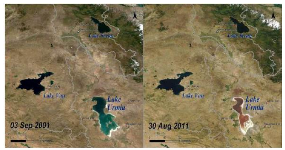
Figure 5. Comparison of three lakes of similar size- Lake Sevan, Lake Van and Urmia Lake from 2001to 2011

To cite this paper: M.Majediasl, A.Sangi.2013. Investigation of Dam Construction Effects without Environmental Assessment (Case Study: Urmia Lake). J. Civil Eng. Urban.,3(4): 201-206. Journal homepage http://www.ojceu.ir/main/