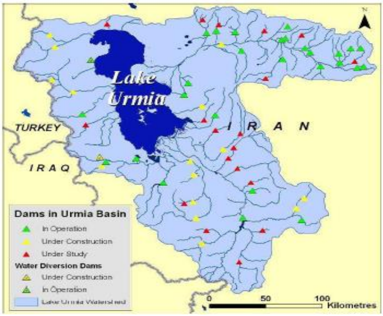
Figure 3. The number of dams within the Urmia lake's basin