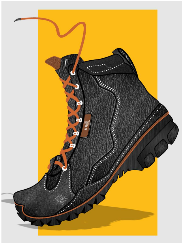
Figure 5. The designed safety boot