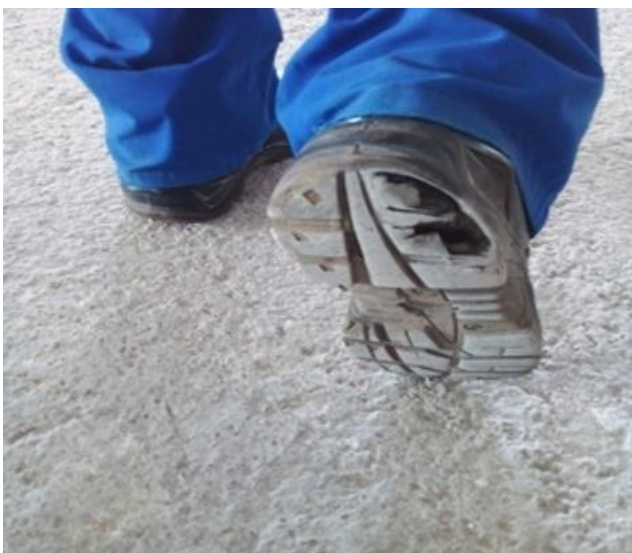
Figure 2. Worn-out boot in use.