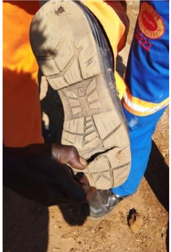
Figure 3. Worn-out safety boot sole.