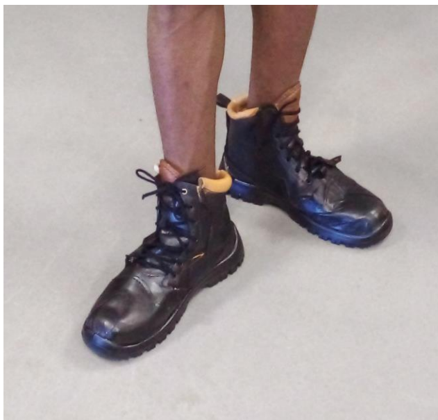
Figure 6. Ergonomic Safety Boot prototype for construction workers in Botswana.