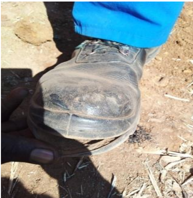
Figure 3 illustrates damaged boot soles. In some instances, the soles seemed to peel off from the safety shoes. Such boots no longer offer adequate protection from injuries that can be caused by nails or other sharp objects on the ground. This level of damage also compromises the boot's ability to provide proper support and cushioning, which could contribute to fatigue and long-term foot health issues.

Symptoms of calluses were found on the underside of workers' feet, along with skin discoloration and damage. These symptoms not only cause discomfort but can also alter a worker's gait, potentially leading to musculoskeletal issues if left unaddressed.