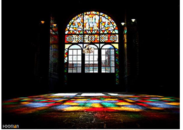
Figure 5. Examples Orsi

To select architectural materials in present time, the issues such as climate condition, heat conduction coefficient and ecological materials shall be considered like ecological architecture and technologies and new ideologies in architecture and discussions about strengthening, lightening and industrializing the monument will offer new material to fulfill the aims of this architecture.