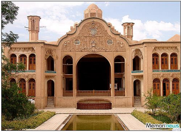
Figure 2. Summer house of Borojerdiha house in Kashan