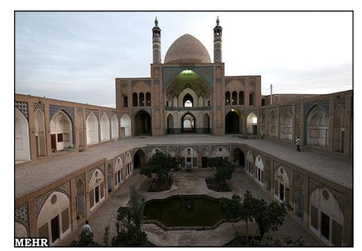
Figure 4. Garden cavity Aga Bozorg mosque and school in Kashan

In the ecological architecture of Iran, the principle of ecological materials is considered as one of the principles of monument's consistency with nature and the materials were always available in case of need for repair; the sample of which can be seen in garden cavity, the soil extracted from garden was used to construct the same monument. The main materials used in ecological architecture of Iran include: clay, thatch, adobe, brick and wood. Even though, using clay and thatch showed financial poverty and energy scarceness, clay is one of the most sustainable and recyclable building materials. At the same time, since these materials can store heat in them and have higher heat capacity, they functioned well in supplying heat energy of sun. The heat and cold in the space can be stored in the element with higher heat capacity and returned to it in case of need; this will help less temperature fluctuation in inner environment. Heat capacity depends on the kind and thickness of the used materials in the monuments; in ecological architecture one of the reasons to make the walls thick was to supply heat capacity regarding the used material in order to provide environmental tranquility.