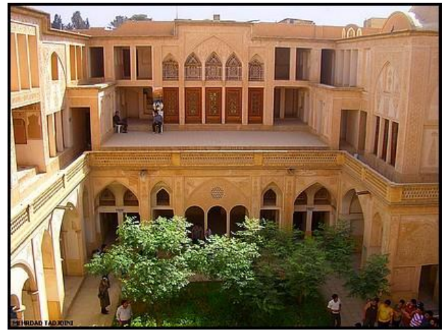
Figure 3. Winter house of Abasiyan house in Kashan